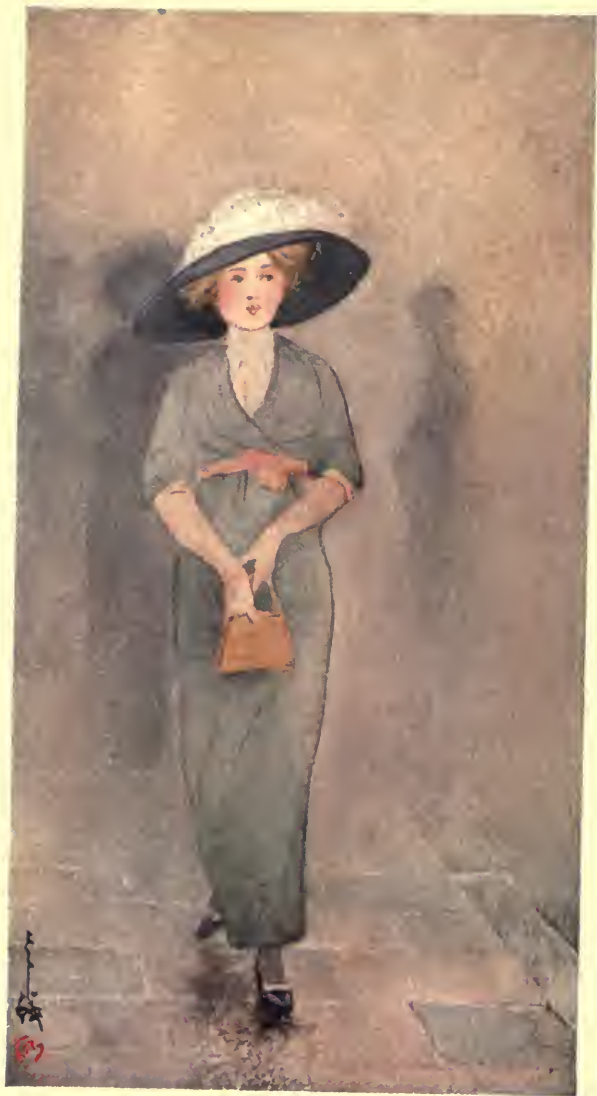
IN LONDON FOG.